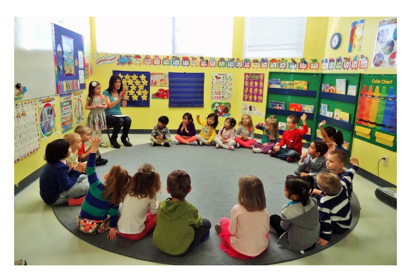
Prepare school environment