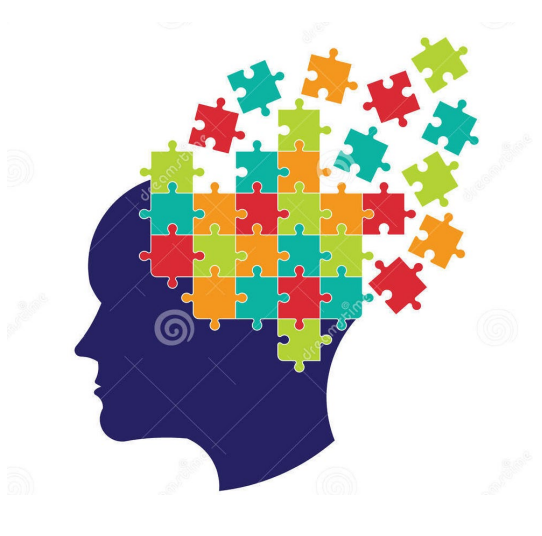
Know the school system