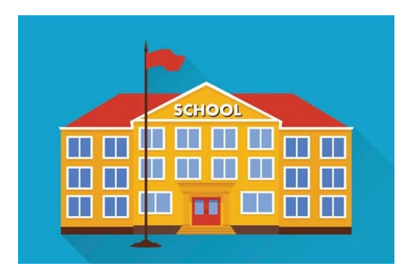
Familiar with school system