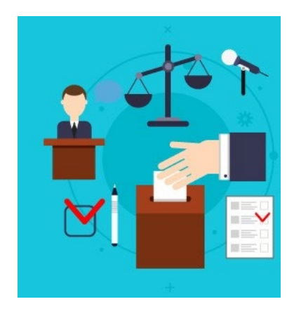
Teach parents advocacy skills