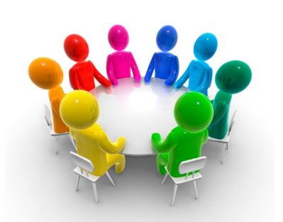
Key players at transition meeting