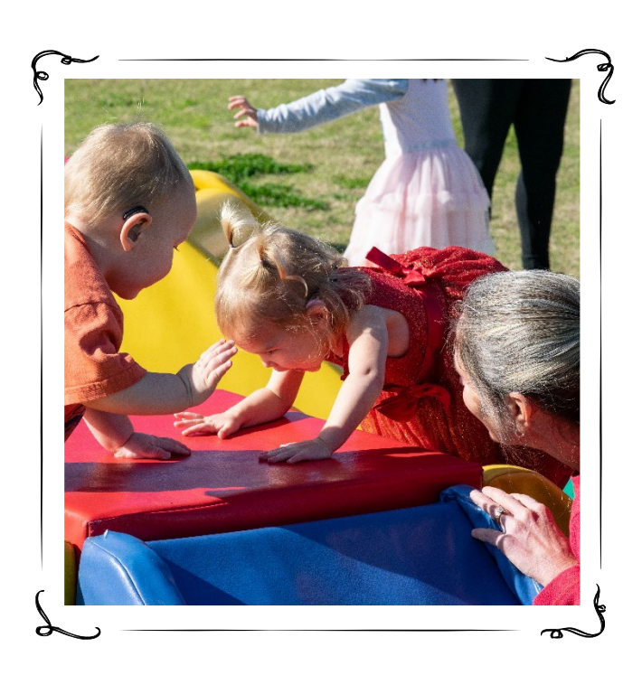
Families gathered at the event