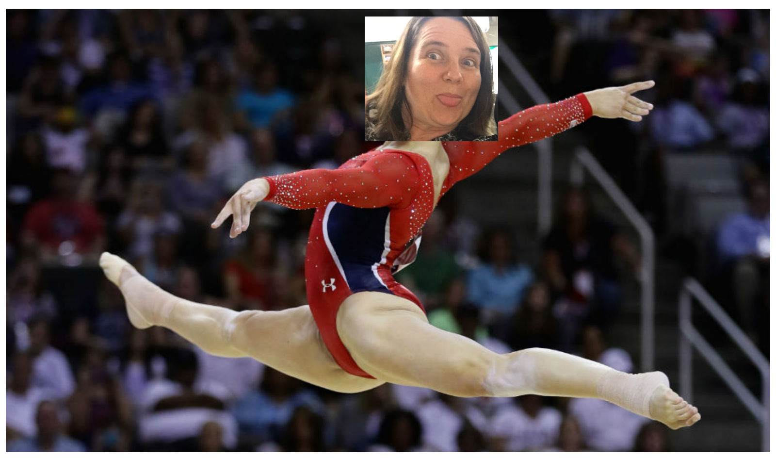
Olympic gymnast Aly Raisman.