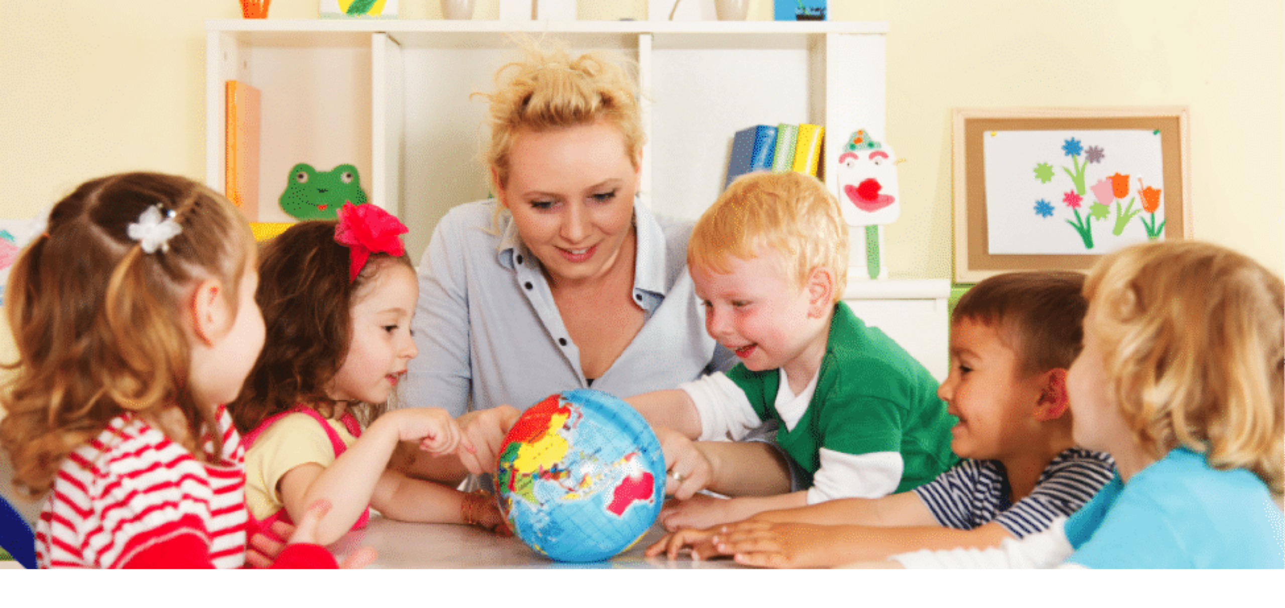
LANGUAGE for Understanding Shared Concepts & Experiences