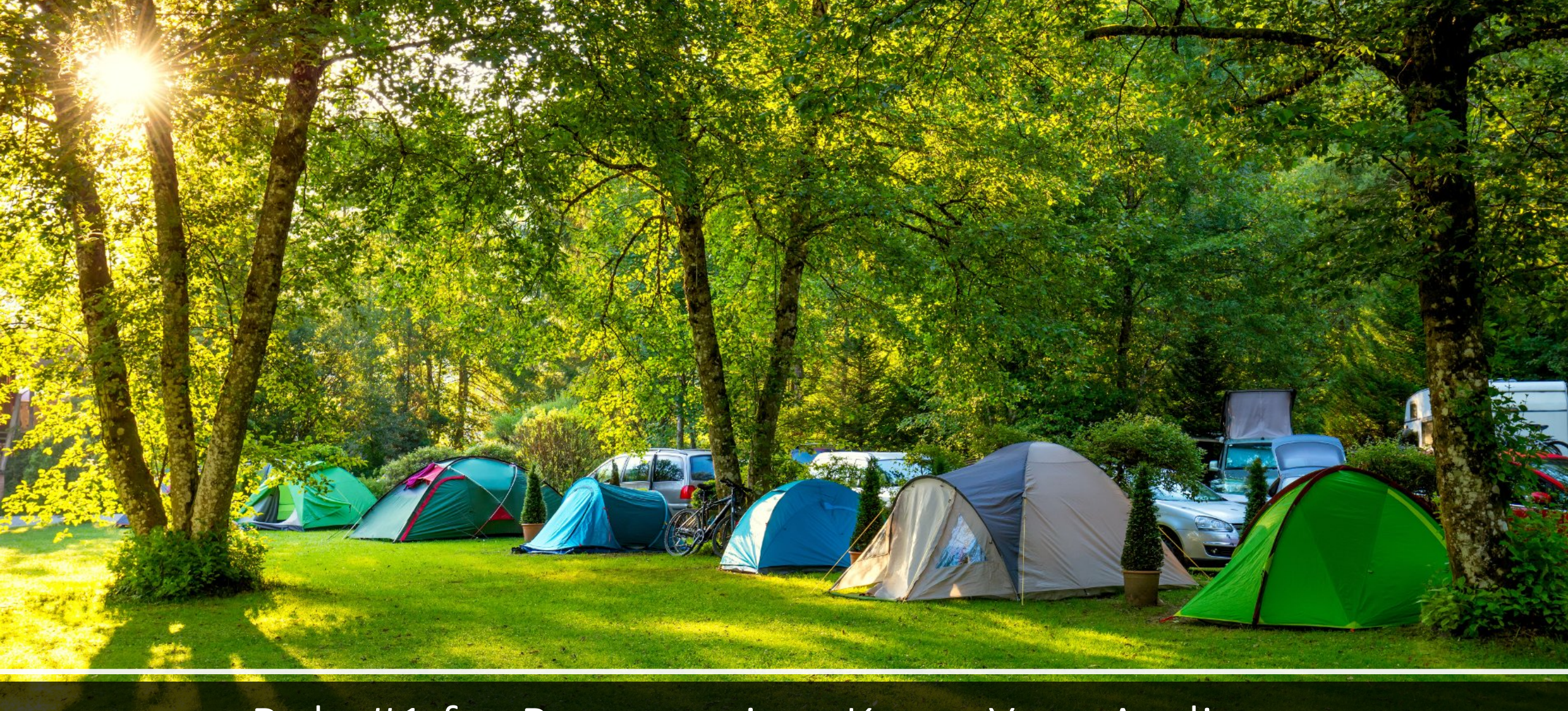
Rule #1 for Presentating: Know Your Audience