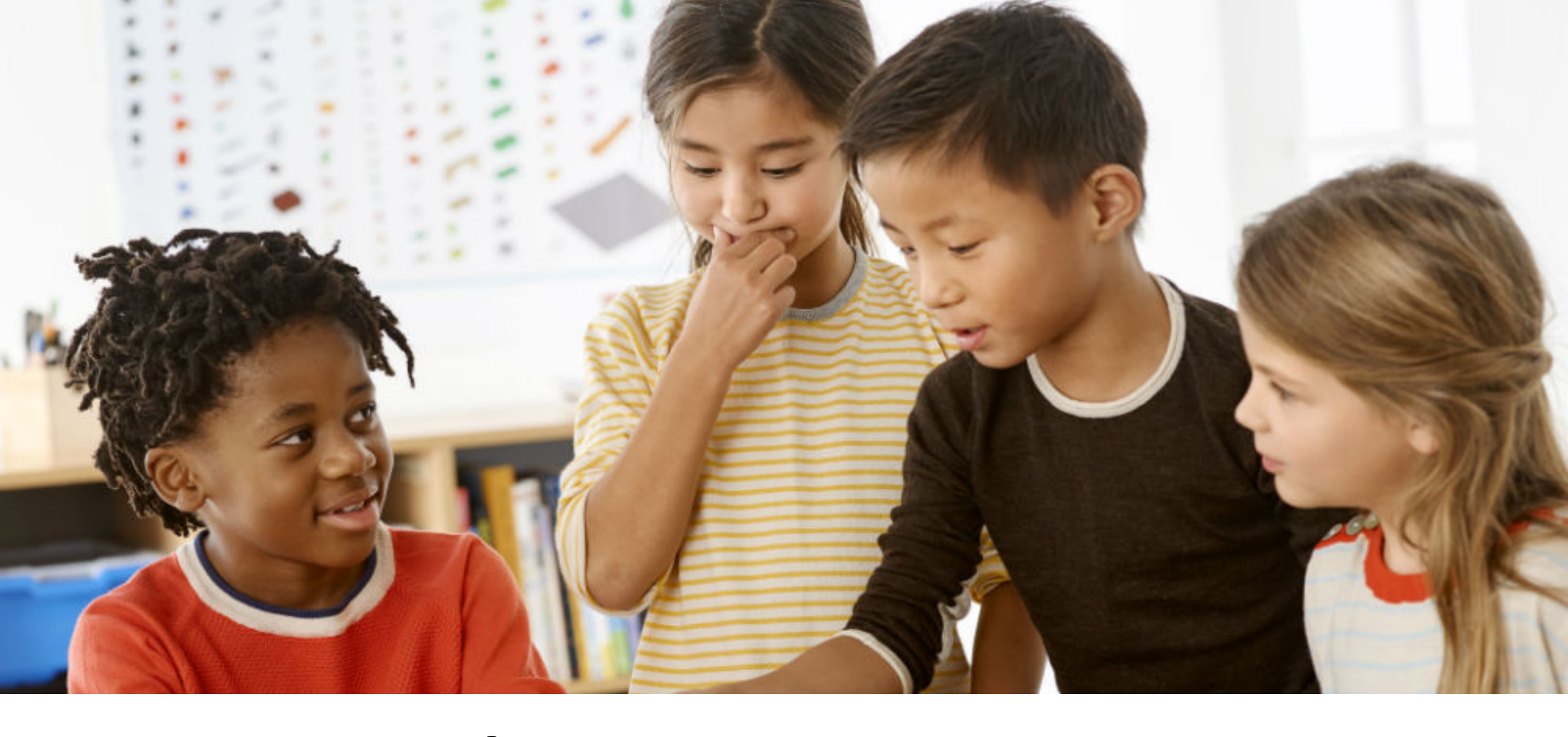
LANGUAGE for Connecting & Communicating