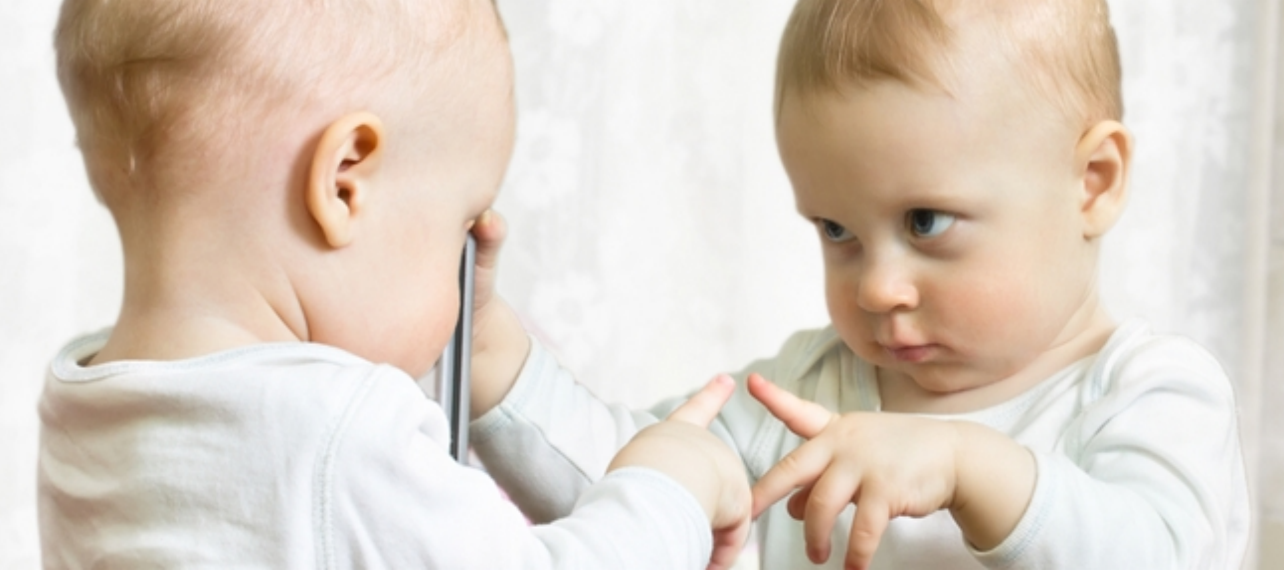
LANGUAGE to understand others' perceptions/intentions & to regulate oneself