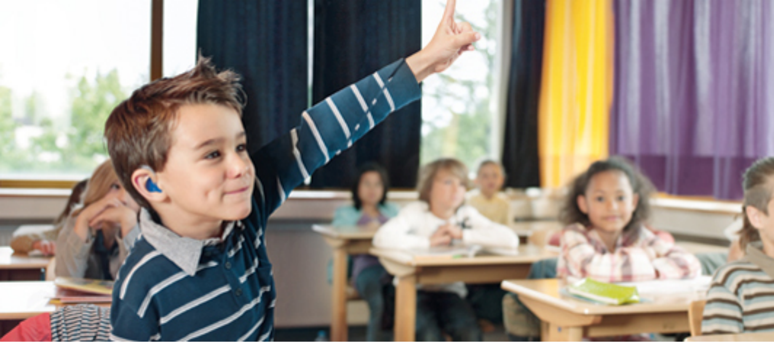
LANGUAGE for Thinking and Problem-Solving