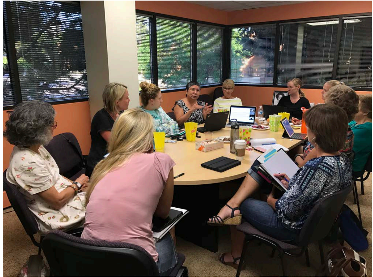
In person- Listen office with friends/snacks