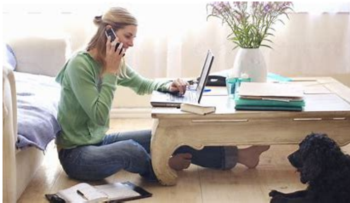
Online- from sofa or home patio